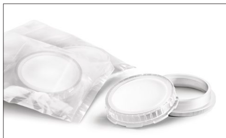
Gelatin Membrane sampling heads

Water soluble gelatin membrane filters are the perfect way to quickly capture SARS-CoV-2 in air samples.