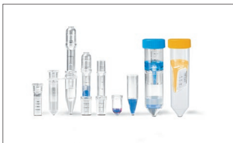
Vivaspin® Centrifugal Filtration Device from 100 µl to 20 mL

The product range includes several membrane materials and molecular weight cutoffs (MWCO), to cover a wide range of applications.