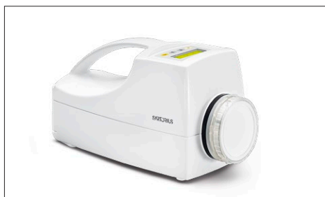
MD8 AirPort air sampler

With the help of the portable AirPort MD8 air sampler, the air of all high-contamination risk areas can be sampled for coronavirus. After sampling, the membrane filter can be dissolved in minimal volumes of water or buffer, aiding with RNA sample preparation prior to rapid tests methods such as PCR.