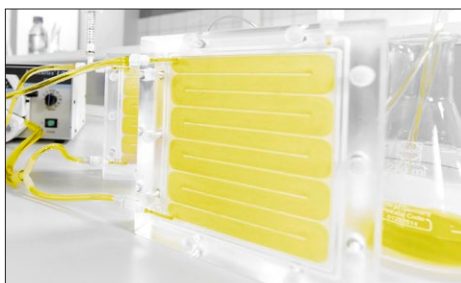
Vivaflow® Tangential Flow Filtration devices from 50 mL to several liters