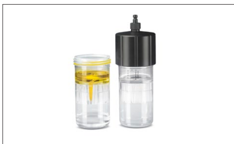
Vivaspin® Centrifugal Filtration Device from 20 mL to 100 mL