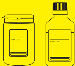
RPMI 1640 Medium