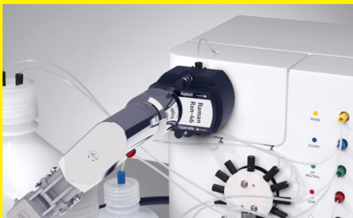
BioPAT® Spectro flow cell with Endress+Houser Optical Analysis, Inc probe connected