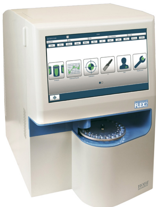
Nova Biomedical BioProfile® FLEX2 and ESM