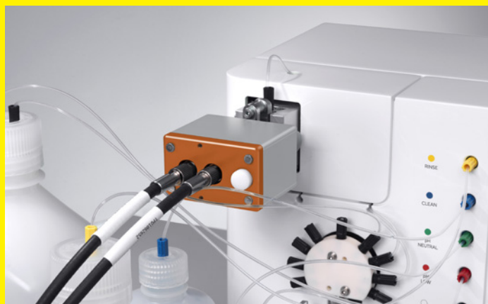
BioPAT® Spectro flow cell with Tornado Spectral Systems probe connected