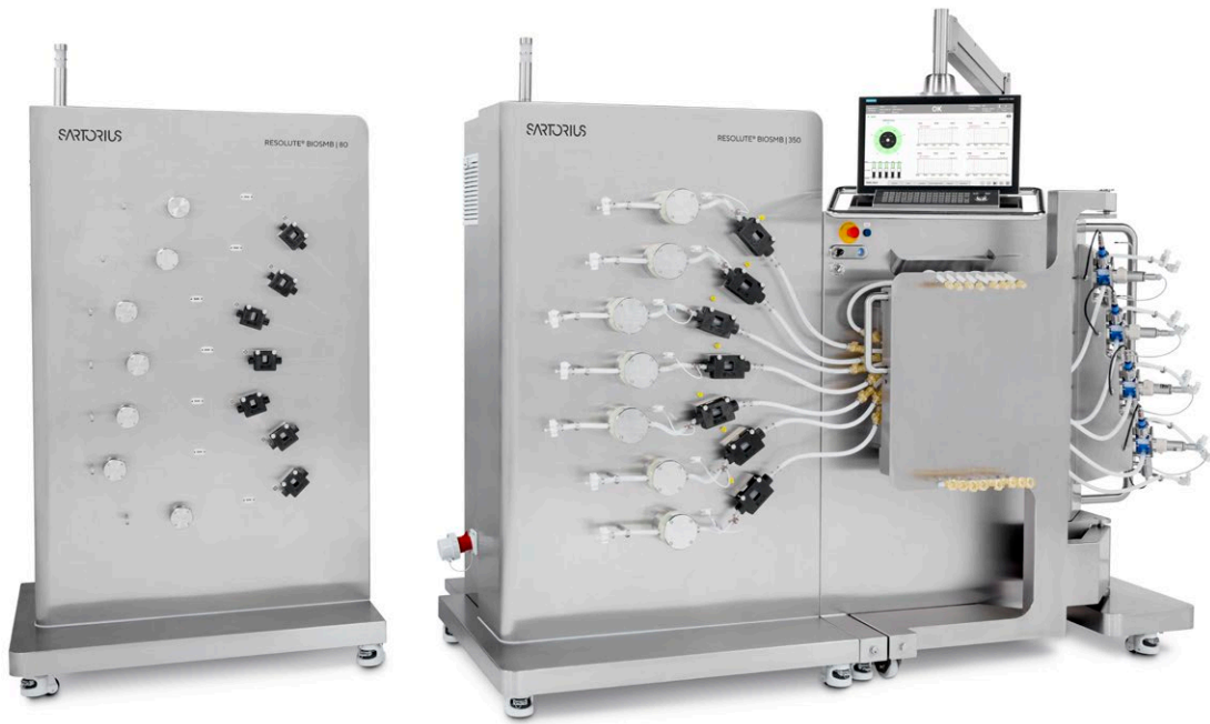
Figure 2: Resolute® BioSMB 350 System With Optional Lower Flow Pump Module Resolute® BioSMB 80