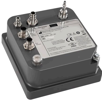
Accessory Kit for External Venting

The accessory kit is certified for use in hazardous areas (ATEX, IECEx, FM) and can be used with alcohol-wetted filters. It can be used with the standard tubing length of 2 and 5 meters. The pneumatic flow path of the AKEV can be cleaned with up to 0.5 M NaOH at max 50 °C when using the Automated Cleaning Kit.