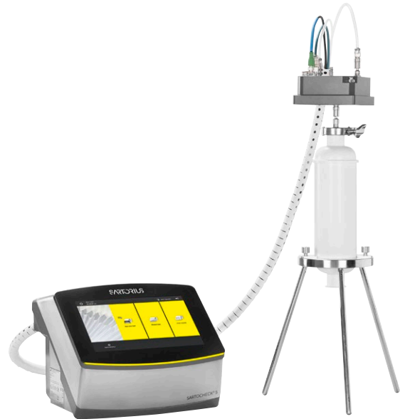
Setup of Accessory Kit for External Venting

The optional Accessory Kit for External Venting (AKEV) consists of a venting valve and a blocking valve and includes a pressure sensor that is identical to the one used inside the Sartocheck® 5. The kit can be used in conjunction with the Sartocheck® 5 to avoid any unwanted siphoning of liquid. This precludes cross -contamination between product-soaked filters being post-use tested and new filters being pre-use tested (e.g., PUPSIT).