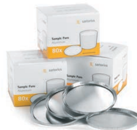
Disposable sample pans